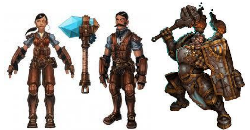
Figure 1, Engineer. Figure 2, Engineer Battle Armour<sup>39</sup>

seen in the monocle wearing Engineer in clothing reminiscent of Victorian explorers:<sup>38</sup>