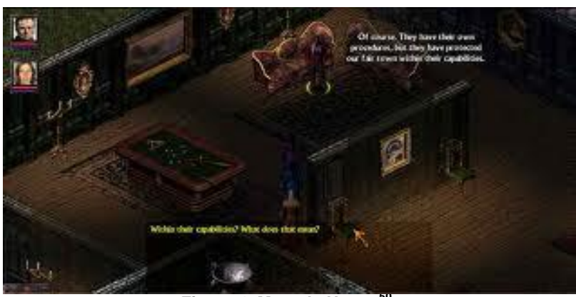
Figure 4, Mayor's House<sup>50</sup>

This re-imaging of the Victorian is also seen in the structures and cities in steampunk texts. The buildings and structures in Arcanum , for example, evoke the same aesthetic as Victorian era buildings and structures. The streets in the industrial city of Tarant are cobble stone, there are scattered electric street lights, a rudimentary sewage system and the buildings are made of large grey brick. Posters hang on walls and inside the furnishings are ornate early-Victorian elegance: