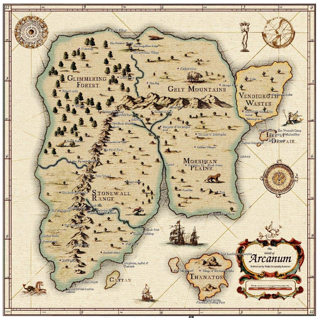
Figure 3, Map of Arcanum<sup>4</sup>

For instance, Arcanum takes place in the land of Arcanum. Geographically Arcanum is one large continent surrounded by a few smaller islands: