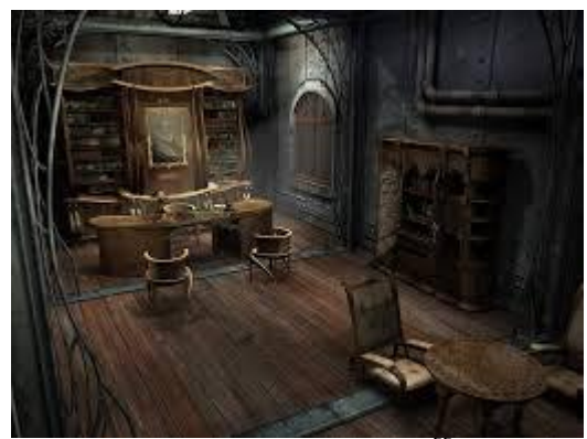
Figure 5, Anna's Office55

of European history<sup>,53</sup> and that '[w]e are dealing with something much more than a simple voyage. The worlds have been reinvented by abstracting reality to bring out the fantasy elements.'<sup>54</sup> The furnishings and buildings in Syberia are rendered in much the same style as Arcanum , except there is a decidedly more industrial look.