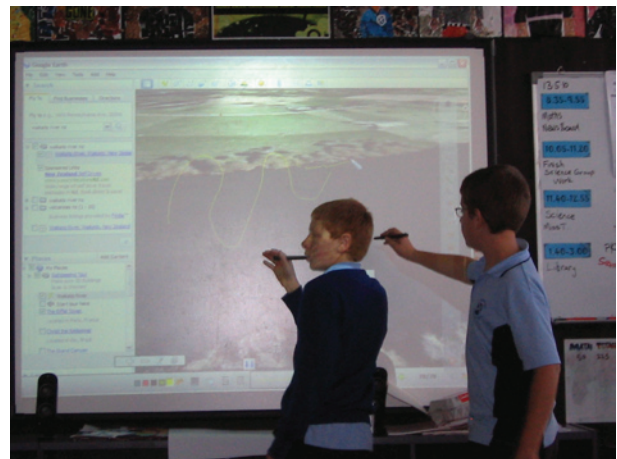
Figure 1: Thinking about river currents using Google Earth and the IWB