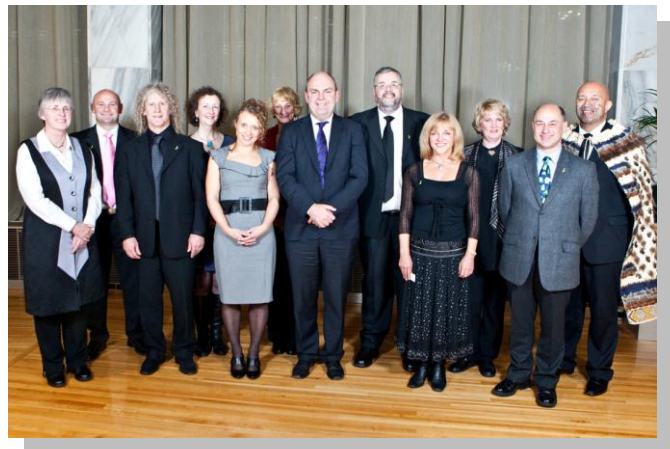
The 2010 award winners with Minister Joyce

The focus of this section is on the principles and processes that govern the way you plan a course or programme. An essential component is that you can demonstrate the alignment between learning outcomes, teaching strategies and assessment tasks. In this section, it is important not just to claim, that you are following appropriate process, but you need to use examples to demonstrate your learning outcomes and the way that your teaching strategies and assessment tasks align with them. Try to bring the different elements of your course alive on the page. Think of this section, Design for Learning, as a reflective place as well as a description of what you do as you continually develop and refine your courses and programmes over time.