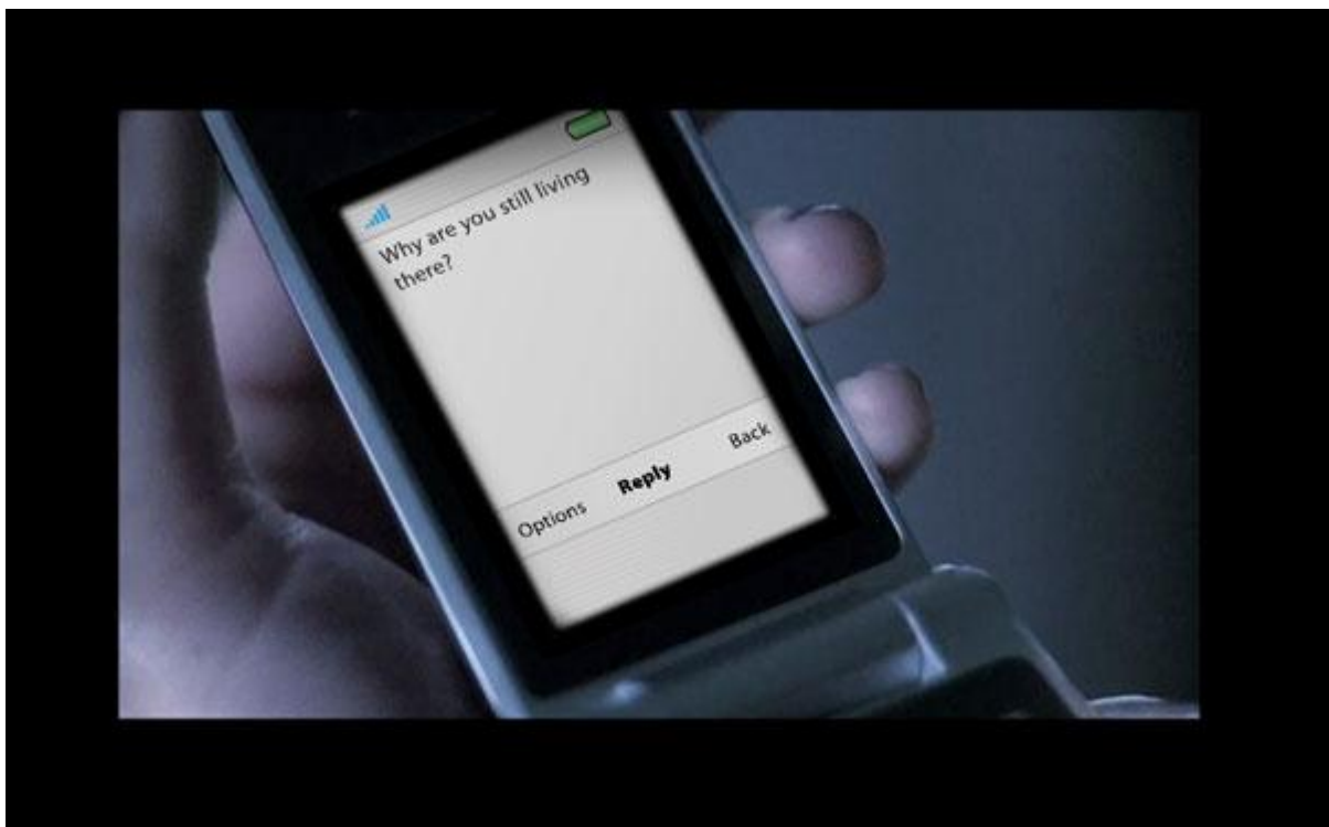
Figure 4: An example of a user's text message displayed onscreen during the streaming of a Reservoir Hill episode.