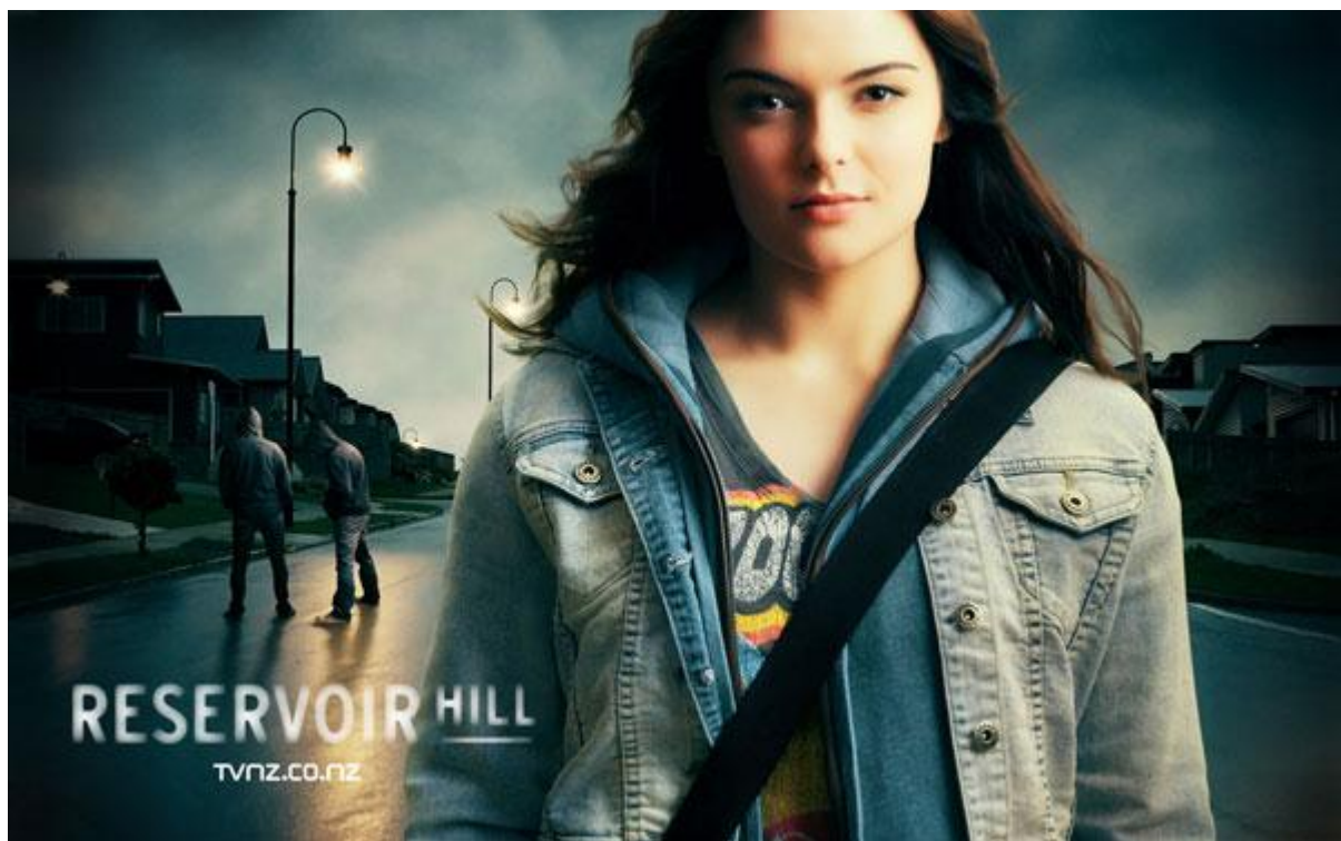
Figure 1: A promotional image illustrating the production aesthetic of online drama series Reservoir Hill

Reservoir Hill is a New Zealand-made online interactive drama series for a youth audience, created by independent producers KHF. Two seasons of this series were broadcast weekly on the Television New Zealand website, TVNZ Ondemand ( http://tvnz.co.nz/video ), from 12th October - 30th November 2009, and again from 13th September - 1st November 2010. The first season was also available on the telecommunications company Telecom's 'T-World' mobile platform. Generically, the series was a mystery drama, incorporating strong elements of soap opera, with a Twilight -style aesthetic that imbued suburban locations with a glowering romanticism.