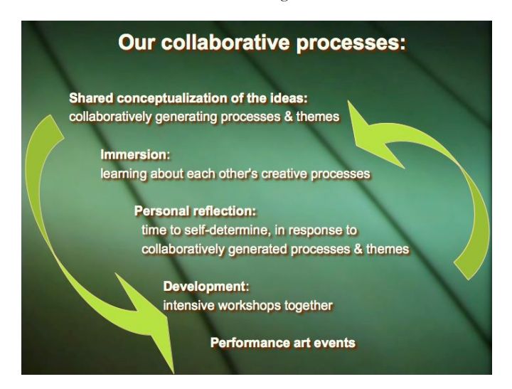
Figure 1. Our collaborative processes

In the final section of this paper we discuss our shared conclusions.