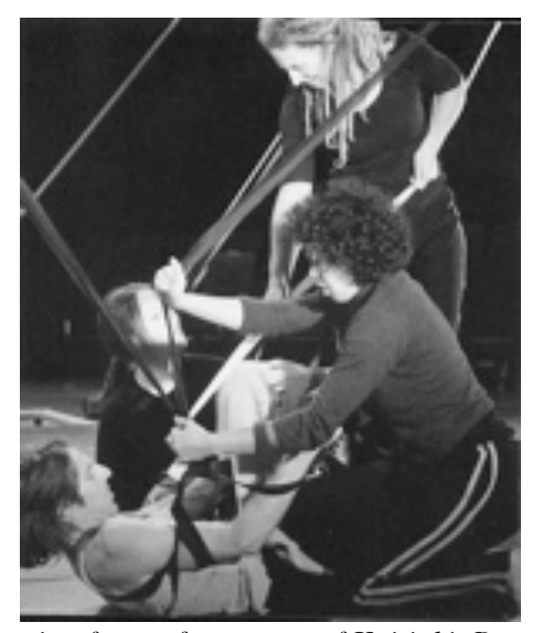
Photo 6. Rehearsing for performances of Kaitiaki. Reasons to care<sup>10</sup>

[Please click Photo 6 below to play Video 3. Stop and start at any time by clicking on the Play/Pause button.]