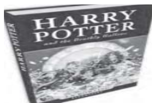
English in Focus VII