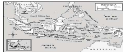
Locally Rings A