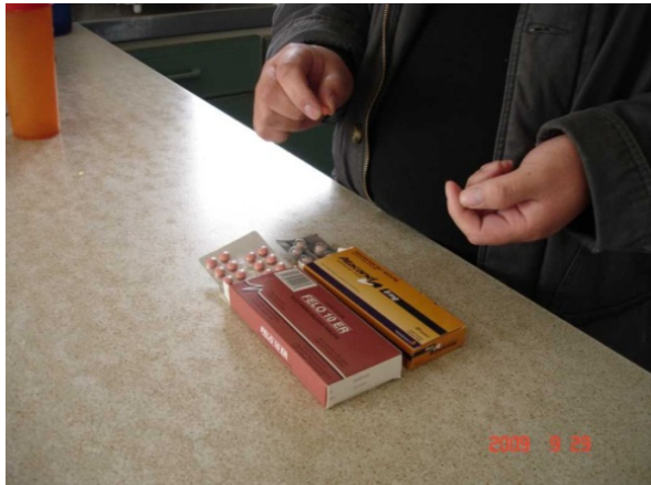
Figure 4. Householder taking medications at breakfast time