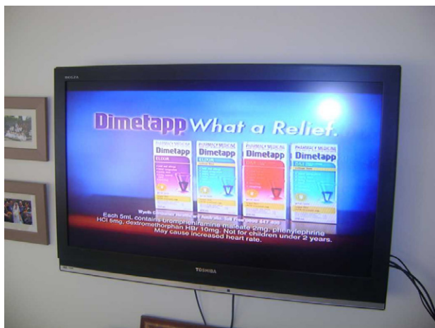
Figure 2. Advertisement for medications enters the home via television