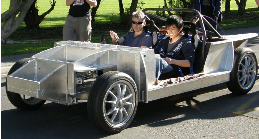
Figure 4: UltraCommuter chassis

For all vehicles the rolling resistance ( RR ) is dependent on tyre type, speed, pressure, road surface and condition and is usually between 0.01 and 0.02 (Bosch, 2004). The RR of a typical ICEV was therefore conservatively assumed to be 0.014. The UC however was fitted with low rolling resistance tyres with an RR of approximately 0.008.