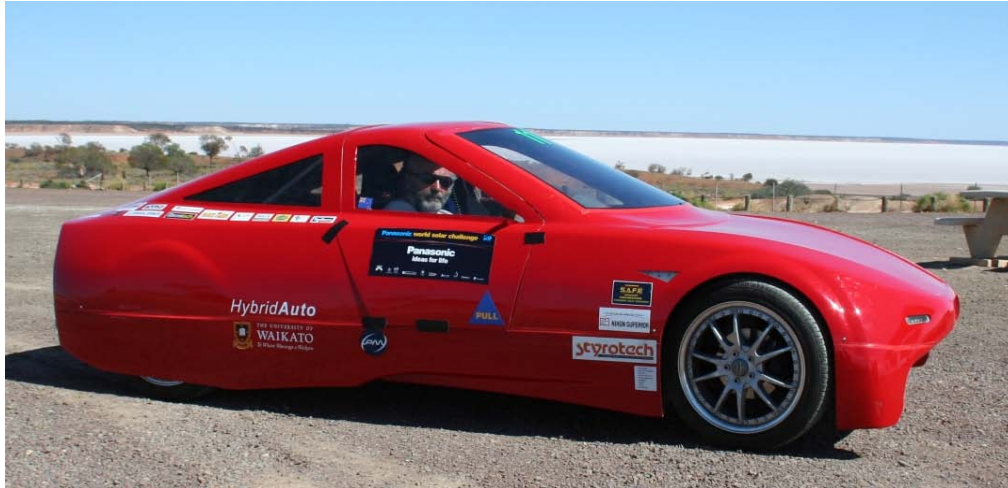
Figure 2: UltraCommuter at 2007 WSC

The UC prototype, shown in Fig. 1, was completed in October 2007 and participated in the Greenfleet Class of the 2007 World Solar Challenge (WSC), completing 2000 km of the route from Darwin to Adelaide.