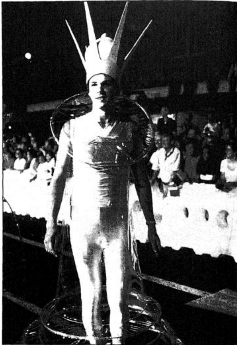
Figure 5.2 Barricades, tourists, and a HERO parader Photograph by Ann Shelton. Reproduced with permission of Australian Consolidated Press, publishers for Metro (Crawshaw 1998, 33).