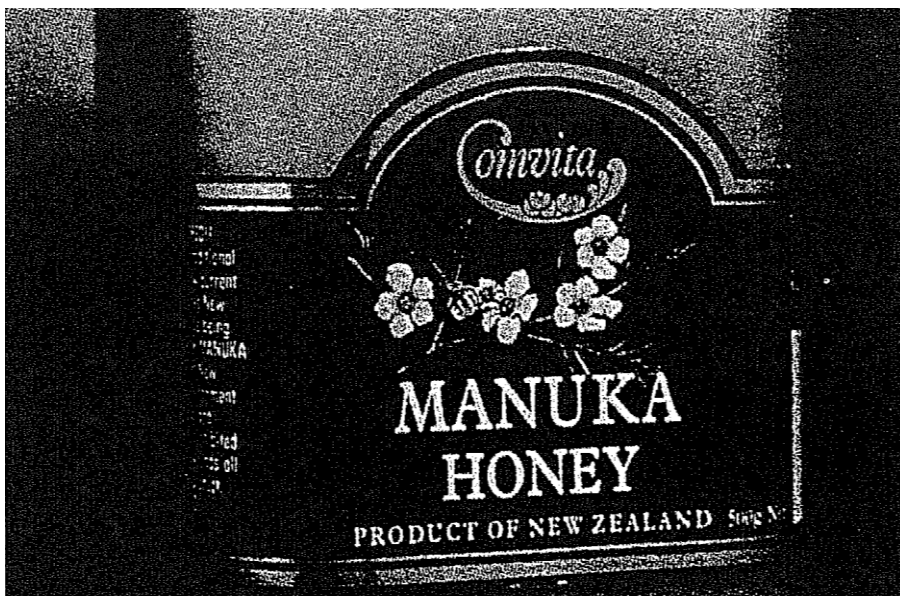
FIG. 6. Manuka honey marketed as an antibacterial product.