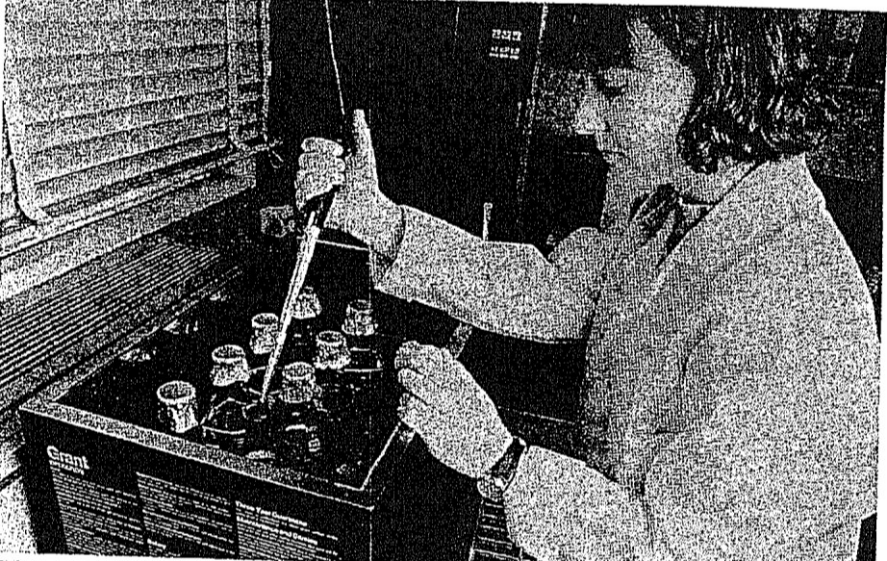
FIG. 5. Sampling broth cultures to measure the rate of bacterial growth with different concentrations of honey added.

high level of activity in one study 4 , but a fairly low 94 or low 35,61,77 level of activity in others. In several studies linden ( Tilia cordata ) honey has been found to have a fairly high level of activity 14,61,77,94 , but a fairly low level of activity in others 35,52 . Clover ( Trifolium spp.) honey has been consistently found to have low activity 4,14 , and cotton ( Gossypium hirsutum ) honey high activity 103,106,128 .