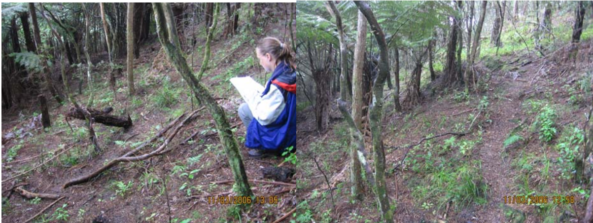
Figure 3: Plot 2. Covenanted Fenced Area

Note: General pictures of the plot.