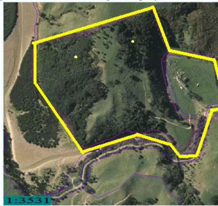
Figure 1: Aerial View of Waingaro Property and Plot Locations.

Note: The left dot indicates the permanent plot in the fenced covenanted area; the right dot indicates the permanent plot in the unfenced area.