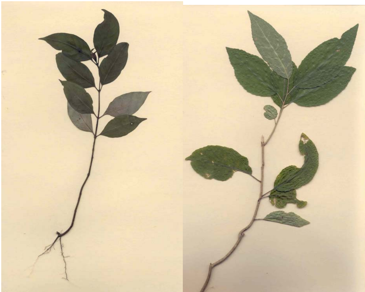
5b (right). Mahoe ( Melicytus ramiflorus ) another 'tasty' species (Note that it has been browsed several times)