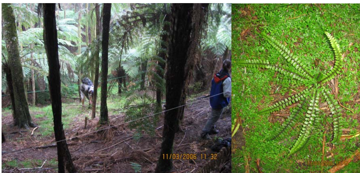
Figure 2: Plot 1. Unfenced and Uncovenanted Area Open to Grazing

Note: General pictures of the plot including one picture of Selaginella kraussiana surrounding Blechnum fluviatile . (Pictures courtesy of Kevin Collins).