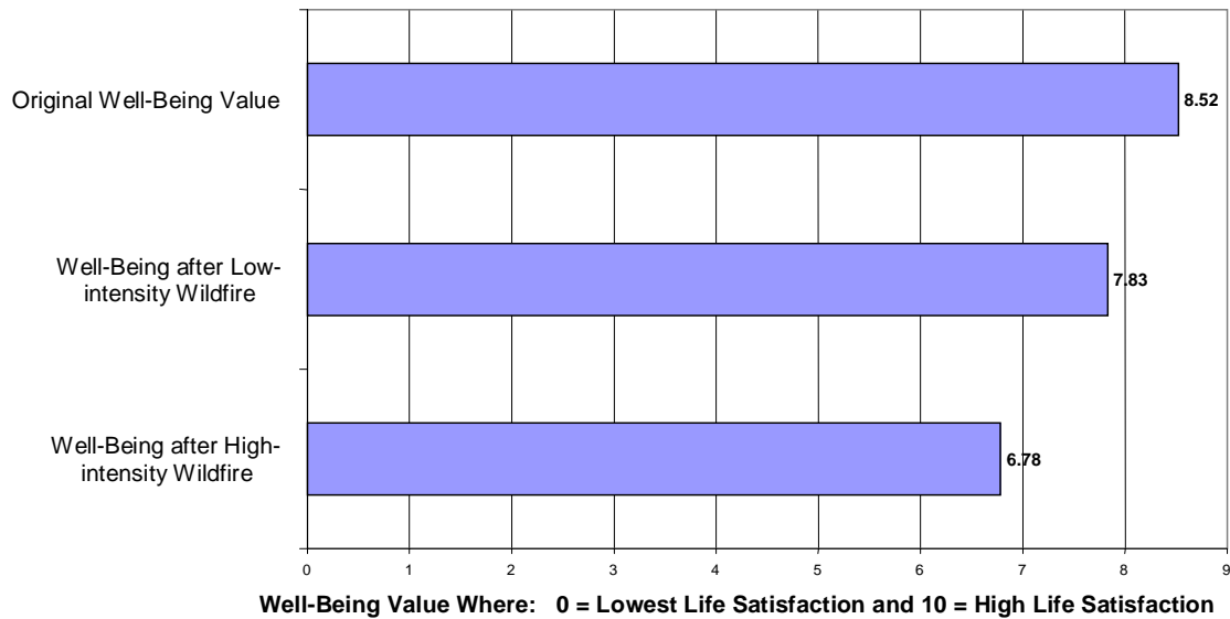
Figure 1: Average Well-Being Values

If a low-intensity wildfire occurred in their area, their well-being level decreased from 8.523 to 7.830, a significant 0.7 point change (ANOVA, p=0.005 ). After high-intensity wildfire, their happiness level decreased from the original 8.523 to 6.784, an approximately 1.7 point change (ANOVA, p=0.000 ). These results show that people living in homes near public lands in Colorado feel pretty good about their lives. If a low-intensity or high-intensity wildfire were to occur, they would still feel good about their lives, just not as good as prior to the fire. A one way ANOVA test showed that these values were statistically different at the 99.99% level (ANOVA, p=0.000 ).