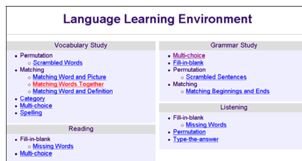
Figure 1 The learner's home page

Figure 1 shows the learner's home page, which displays individual exercise types grouped under by activity. The layout is plain because effort was concentrated on making individual exercises as attractive as possible. Furthermore, the exercise types that were implemented are by no means exhausted; more could easily be generated.