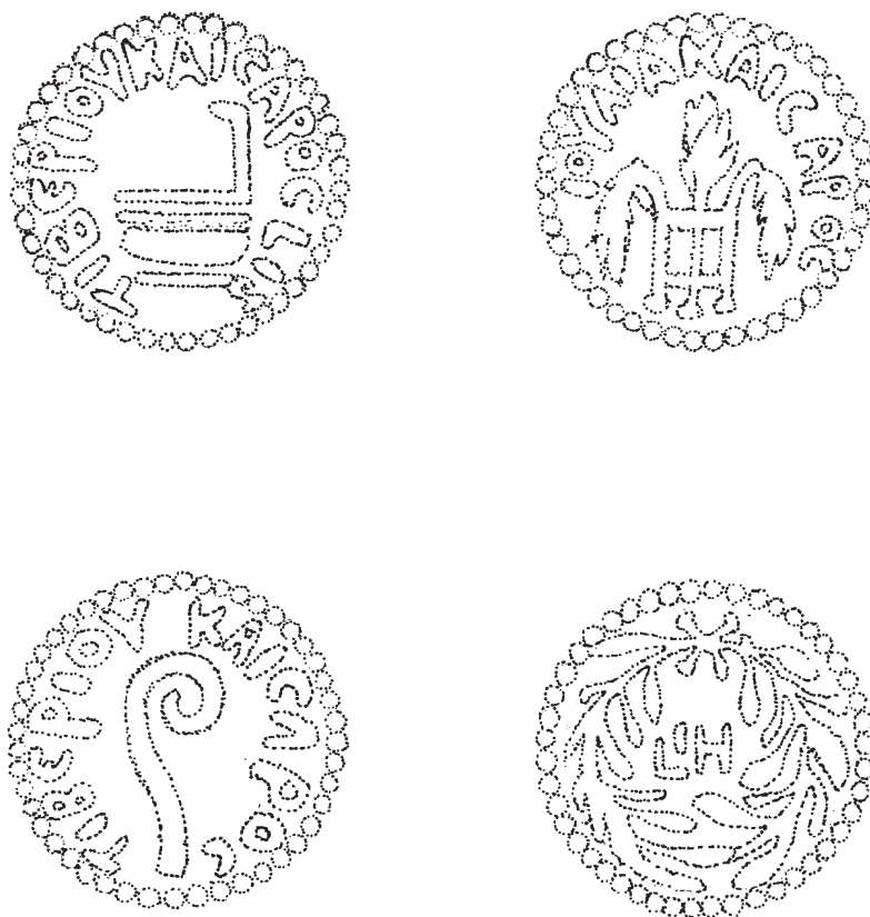
Figure 1: Bronze coins issued by Pontius Pilate: type 1 above and type 2 below. (J. E. Taylor)

There are two types: type 1 shows a simpulum on the obverse and three ears of wheat or barley on the reverse, while type 2 shows a lituus on the obverse with a laurel wreath on the reverse. On the obverse of both coins is the Greek legend 'ΤΙΒΕΡΙΟΥ ΚΑΙΣΑΡΟΣ', 'of Tiberius Caesar'. On the reverse of the type 1 coins there is the legend 'ΙΟΥΛΙΑ ΚΑΙΣΑΡΟΣ', 'Julia, of Caesar', and with type 2 there is no legend on the reverse (see Fig. 1). 9