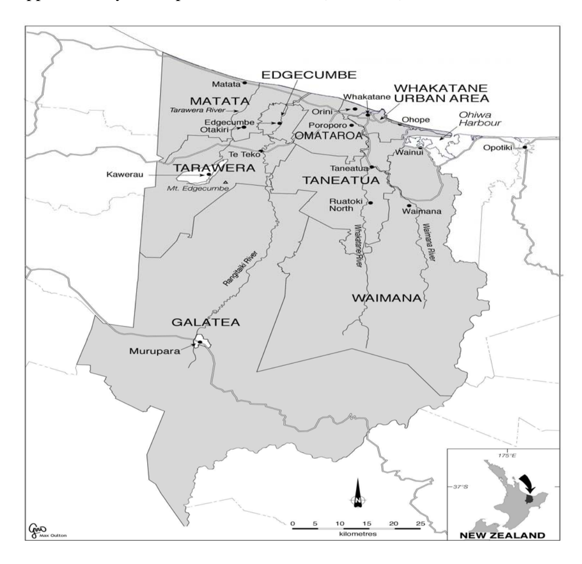
Figure 2: Location map showing communities and wards in Whakatane District

Whakatane District is located in the eastern portion of the Bay of Plenty, an area steeped in Maori history with many natural resources (Figure 2). The total area of the District is 420,000 hectares, with the Rangitaiki Plains making up approximately seven percent of this area (30,000 ha).