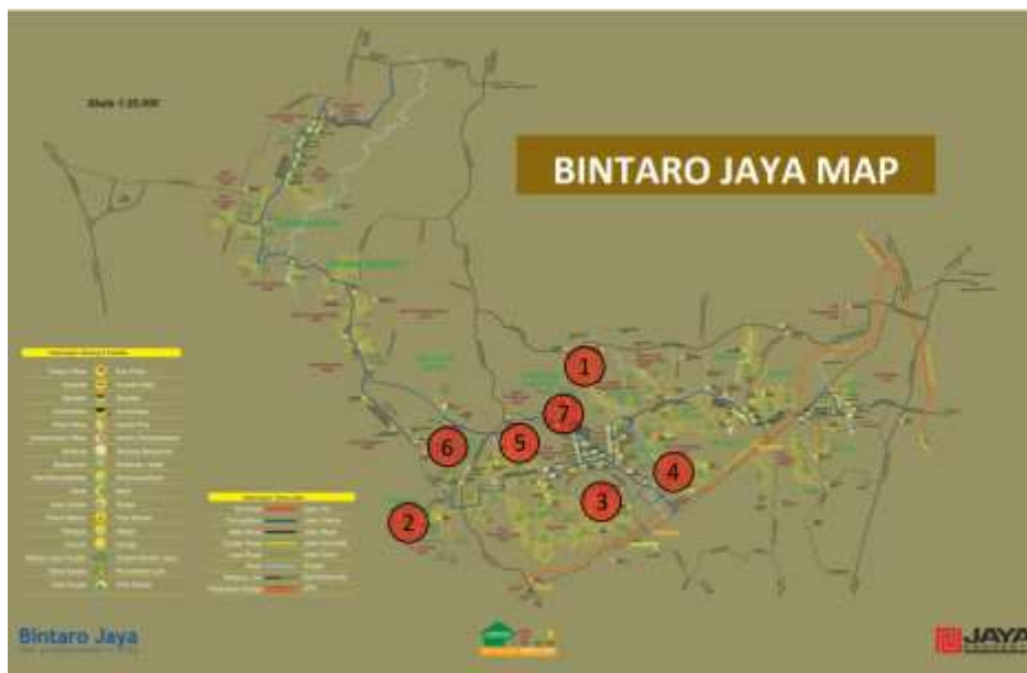
Figure 1. Bintaro Jaya Maps

6. Menteng Cluster; The presence of real estate, access to resources, relationships between individuals, individual and social balance, and feelings perceived well by the surrounding community with above average values. The living environment, relations with institutions, and participation are seen as not good with a value of 2.73; 2.25; and 2.47.