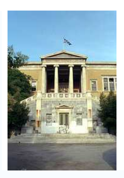
Figure 2: Front entrance to the National Polytechnic University in Athens

(Athens Polytechnic) places a graphic of the main building of its downtown campus. Although the graphic is much smaller and inconspicuously placed at the top right hand corner of the website, it too provides a symbol for Greece. It is one of the surviving buildings when the University, one of the first in Greece, was known as the Royal School of Arts. More importantly, though, it symbolizes the student resistance against the Greek dictatorship in the 1973. Both the downtown and the Zografou campuses became centers for student protest, and the building became a symbol of that protest.