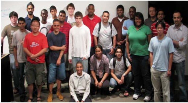
Figure 1. The Fall 2010 eStadium VIP team. They design, develop, and deploy systems that enable studies of wireless network traffic during football games. Fans in the stands go to: http://estadium.gatech.edu/iphone to access stats and on-demand video clips of plays for GT football games. Students from CEE, ECE, CS, and ISyE participate in the team. They also design social network apps and wireless sensor networks.

that the project can evolve based on contributions from everyone on the project, including the undergraduates.