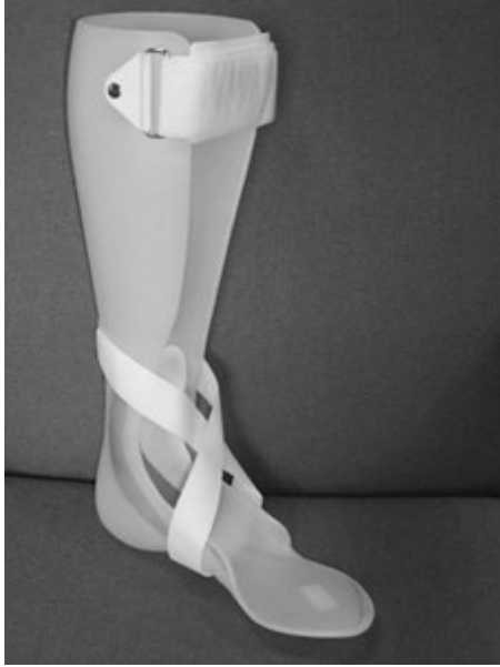
Figure 1 Custom made rigid AFO as specified by study design criteria