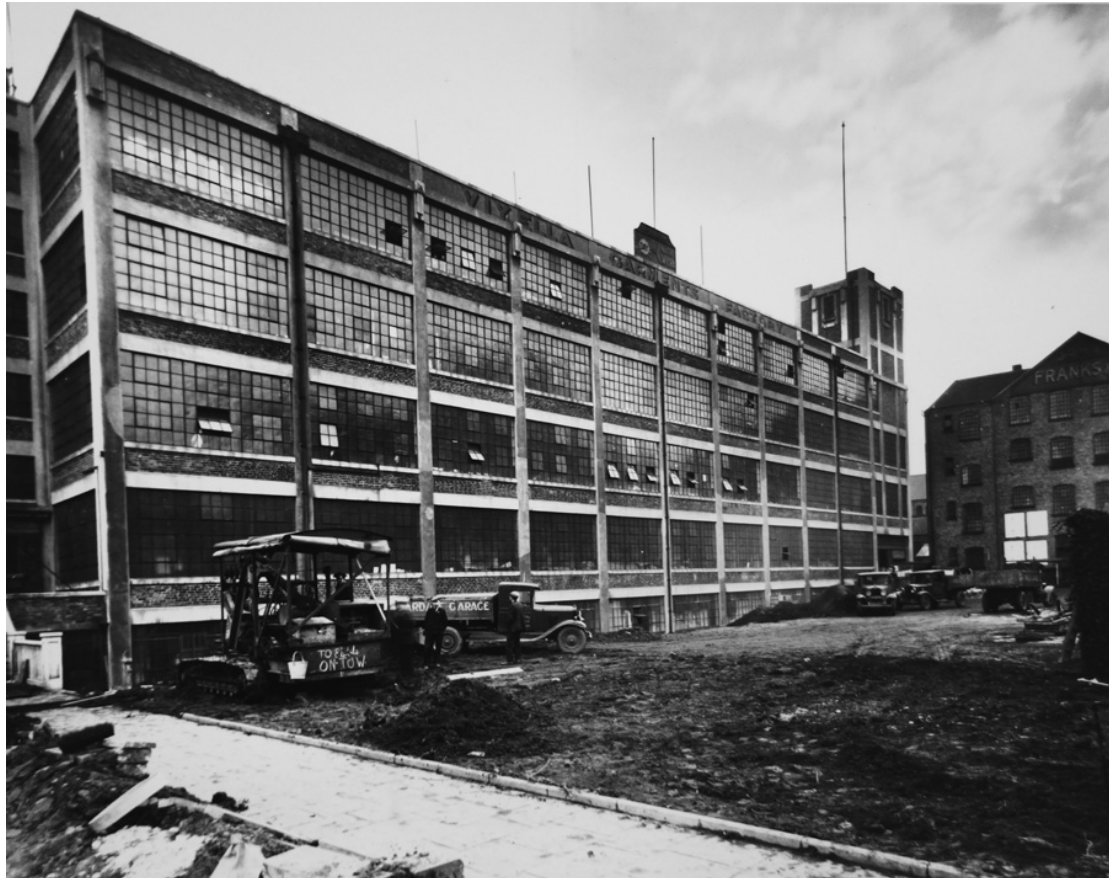
Figure 5. The Viyella Garments Factory, under construction, built 1919 (DD1420/15).

H. Tanner's 1937-8 Dutch-style brick canteen (D31) is an exciting break from this previous approach, which impressively could seat 2,000 staff at one sitting and was selected over a Williams' design. 56 Nor was Williams commissioned to design any of Boots' nationwide shops, though they were continuing to expand in number. However, as the threat of another war loomed ever closer, Boots commissioned Williams to design six 'splinter proof bomb shelters' (D12) to accommodate bicycles and provide protection for 1500-2000 people (Figure 4). 57 The final result was the purest proto-Brutalism on site: entrenched hexagonal concrete cylinders that allow for a generous central gangway and overhead ventilation with slated benches. Although little discussed by the city or architectural historians, the firms publicity department presented these as a corner stone of their lauded air raid precautions. 58 For Boots it seems concrete was considered as industrial and utilitarian but not paternal or commercial.