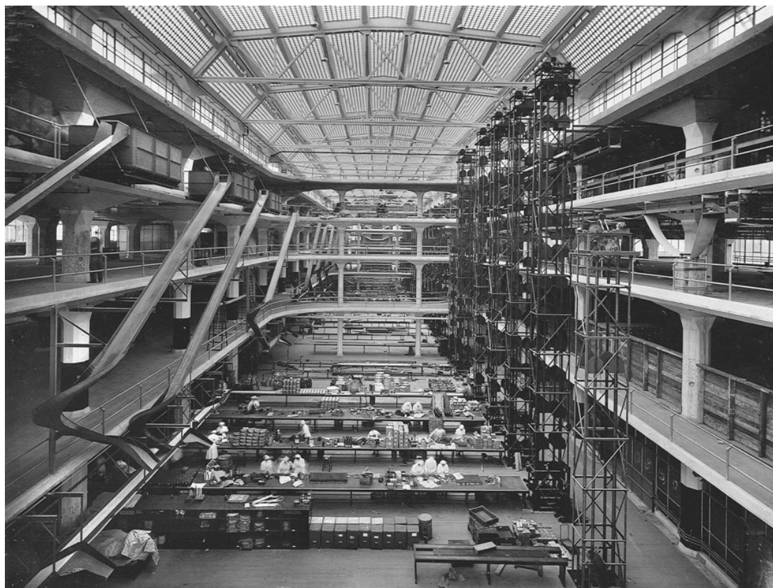
Figure 3. D10 interior packing hall, c.1930s (CAIS 6531).

Since the 1860s Boots had grown from a small local concern into the largest retail chemist in the country with over 600 shops and 13,000 staff nationwide by the 1920s. Primarily driven by the autocratic Jesse Boot, his liberal paternalism was endeared throughout the city, yet by 1920 Boots appeared vulnerable and disorganised: Jesse was now an invalid and unable to keep a close eye on his huge business. With bankruptcy possible, Boots was sold to the American United Drugs Company, injecting Boots with new ideas about territorial management and manufacturing. 41