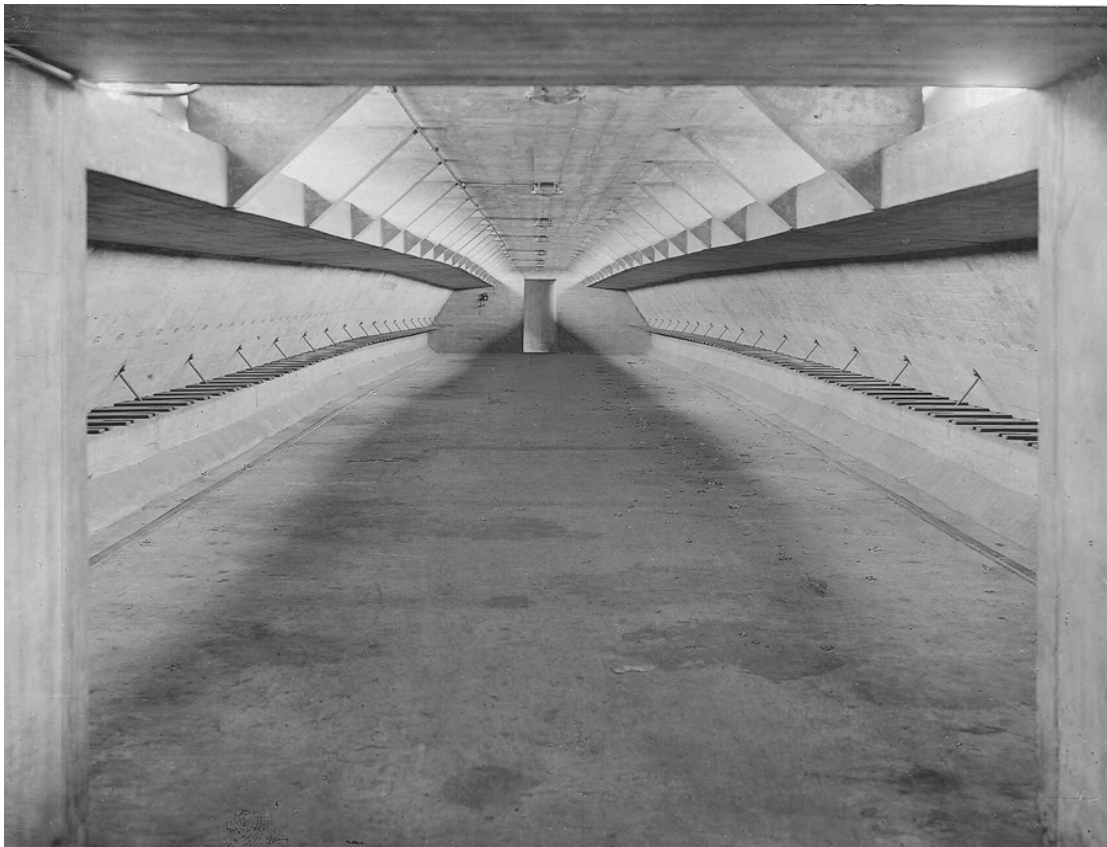
Figure 4. Bicycle shed and bomb shelter (D12), by Owen Williams, c.1939 (CAIS 3468; courtesy of The Alliance Boots Archive and Museum Collection).

A 1934 Boots souvenir of a D10 factory visit re-iterated, ‘The modern world denies that drudgery is blessed, the modern factory has abolished drudgery.’ 52 In the local press Lord Trent, the head of Boots, used this as an opportunity to promote ‘concrete plans for using machinery to create more leisure’, 53 with, ‘a compulsory month's holiday’ and calling for ‘a Roosevelt plan to employ a million men’. 54 Boots had a vast in-house publicity machine awash with articles and photographs, and though the concrete wasn't fetishised its technological and social achievements were – for Boots' staff this new efficiency had brought about the five-day week with no cut in pay. 55