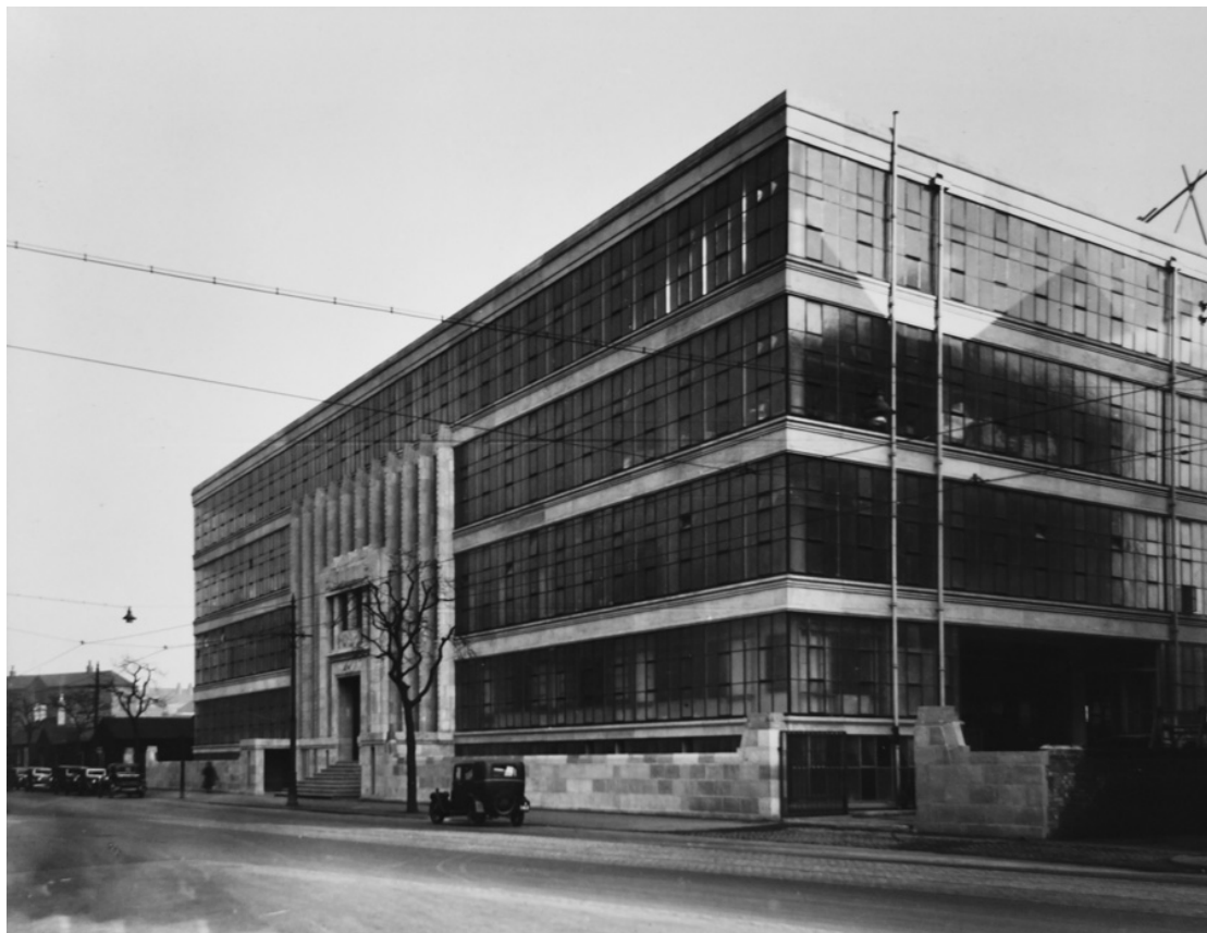
Figure 6. William Hollins & Co, Viyella House, built 1933 (DD1420/30).