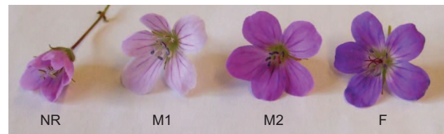
Figure 1. The floral phases in hermaphrodite G. sylvaticum flowers. NR = Non-receptive phase, M1 = Male I phase, M2 = Male II phase, F = Female phase. See Materials and methods for more details. Flowers were collected from different plant individuals, and therefore show differences in coloration. doi:10.1371/journal.pone.0062575.g001

Therefore, in female flowers only two phases can be recognised: NR and F. On average, both female and hermaphrodite flowers remain open up to two to three days (S. Varga and CD. Soulsbury,