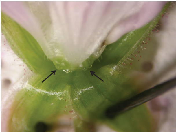
Figure 2. Position of the nectaries in a G. sylvaticum flower. Arrows show nectar droplets. doi:10.1371/journal.pone.0062575.g002

cut from the plant, placed with the peduncle into water in an Eppendorf tube to minimise the risk of desiccation, and brought to the lab within 30 min from the time of cutting. We noted flower gender (female, hermaphrodite) and the floral sexual phase. Nectar was extracted with paper wicks as described in [38] under a stereomicroscope to calculate total carbohydrate content. Nectar samples were then kept in an exiccator until total carbohydrate content was determined using the anthrone method [10], pp: 176–177). We prepared a series of sugar standards ranging from 0 to 50 µg of total sugar per mL of standard using equal amounts of fructose and glucose because even though nectar composition is unknown for G. sylvaticum , in other closely related Geranium species similar dominant proportions of fructose and glucose have been reported [5].