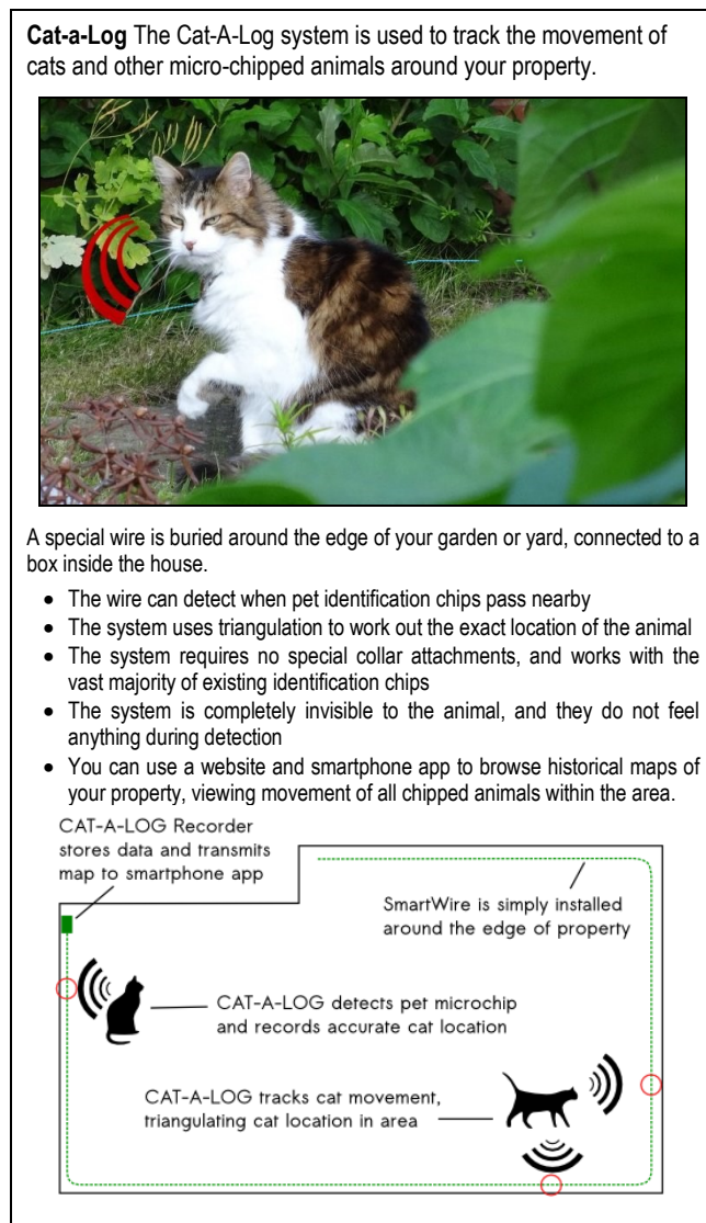
Figure 2 – Example narrative, rhetoric and imagery generated for the Cat-a-Log product.

optimistic (i.e. techno-utopianist) language expresses the supposed benefits of the technologies, but the actual functionality of the systems are obscured (through the use of “clever algorithms”). The prototypes themselves were built using exposed circuitry and wiring to signify their upstream or “near-future” prototype status, as well as lend plausibility to the promised functionality. Although the products were said to be based on “extensive scientific research” there is no evidence for such statements, echoing standard rhetoric drawn from the start-up aesthetic. This attention to the framing of the prototypes was deemed important in order to convey a coherent narrative of near-future technology. Our three prototypes were: Cat-a-Log, EmotiDog and LitterBug; the (speculative) functionality of each is discussed in detail in the following sub-sections.