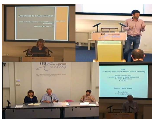
Images taken from the 3rd IIPPE training workshop which took place at the International Institute of Social Studies, the Hague, in advance of the 4th Annual Conference in Political Economy. Recordings of the sessions can be accessed from www.iippe.org

Since founding the organization in 2006, IIPPE members have been active in promoting pluralist economic education and political economy. IIPPE has organized seven successful training workshops, with the eighth taking place ahead of the annual conference in Naples this year. It is the aim of IIPPE to continue with the organisation of training workshops with greater participation of working groups in relation to particular themes and issues covered in future workshops. IIPPE is also in the process of forming a working group on education to take forward issues of training and curriculum development. This group will be conducting a roundtable discussion at the upcoming annual conference on challenges in and reflections of, teaching political economy.