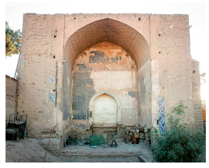
Figure 1. A view of the present situation from the entrance porch.