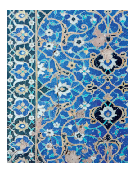
Figure 5. Detailed view of mosaic tiles in the left side of porch.