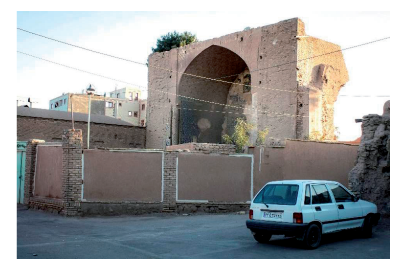
Figure 2. The entrance porch is surrounded by a low wall which distinguishes the boundary between the building and private properties and streets.

The Qara-khitai dynasty was founded by Boraq Hajeb in Kerman, in late 1222 AD. He died after almost 13 years of governance, in 1235 AD in Kerman. He was buried in a school he had built in the Tork-Abad neighborhood in Kerman. According to historic documents, it was found that Boraq Hajeb , in his later years, had designated an area