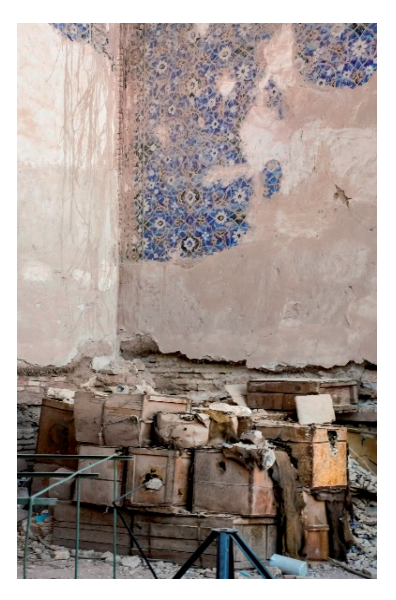
Figure 6. Remains of part of the mosaic tiles in the right side of porch and mosaic pieces in boxes.

The value of 'rarity' in the example of Gobbe-Sabz is present due to the surviving parts and are what remains of the Qara-khitai and Turkan Khatun historic buildings (schools, mosques, and tombs) which have unfortunately been destroyed. Therefore, the remaining porch, which is a small part of the collection, is more important than other similar monuments. In addition, the spiral tile in this building is not present in any other monuments from these periods and therefore increases the value of Gobbe-Sabz in terms of rarity.