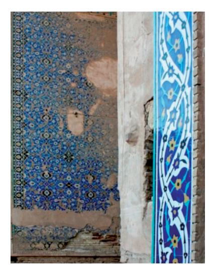
Figure 4. Mosaic tiles in the entrance porch.