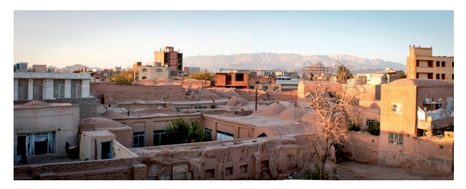
Figure 8. A view from Gobbe-Sabz showing skyline and diversity of private buildings.

The context scale is defined as the surrounding area which includes the monument, its accessibility and position in the neighbourhood. The context scale can be used for protecting and properly understanding the architectural space that is referred to. Today, in the context scale, there is no well-defined space related to the historic period of the Gobbe-Sabz building; however, the open space next to the porch affords an appropriate relationship with the surrounding context. The presence of the porch in an open adjacent space affords visibility from the surrounding streets. By determining the historic area, it can be defined in architectural design guidelines to control the architectural forms, skyline and materials in the buildings around the monument (Figure 8).