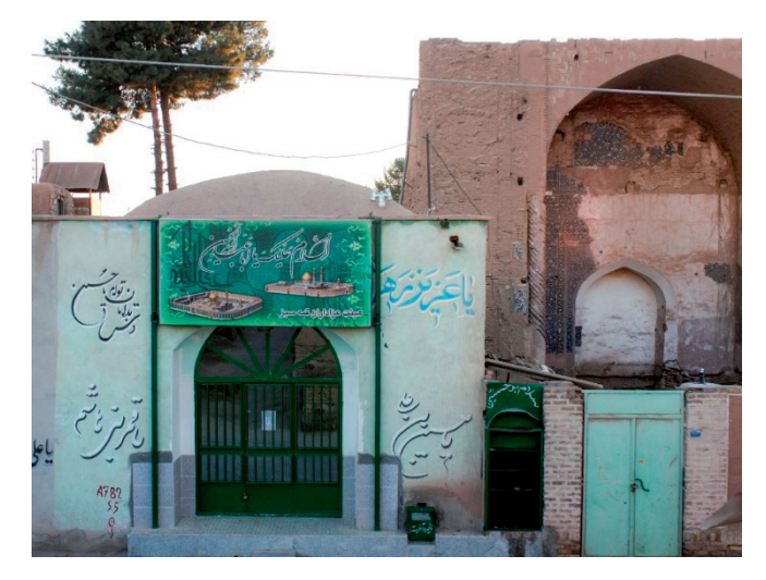
Figure 7. The religious center (Tekye) next to Gobbe-Sabz.