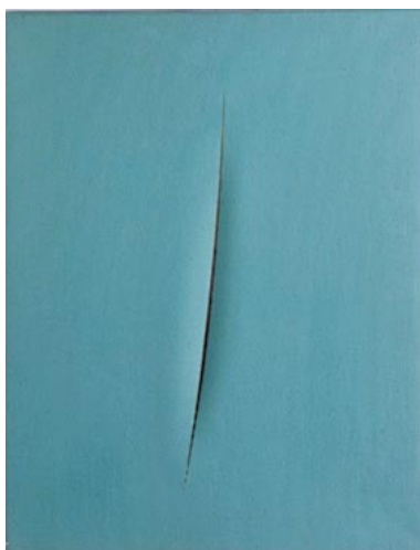
Figura 5. Lucio Fontana, Awaited spatial concept , 1963, waterpainting on canvas, 60 × 46 cm, Private collection [15].

Duchamp's ready-made, for example, are works born from the manipulation of industrial objects extrapolated from daily life and placed in an art context. The replica of a ready-made using the same materials transmits the same message as the original. This is an essential point also due to the consequences seen from a conservative point of view, because it introduces the controversial theme of the "identity" of the work in connection with its reproducibility. Can the work be allowed to be substituted, wholly or in part for conservation reasons, without losing its significance?