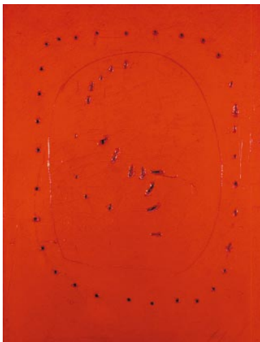
Figure 4. Lucio Fontana, Spatial concept , 1960, 116 × 90 cm, Trento and Rovereto Museum of Modern and Contemporary Art [14].