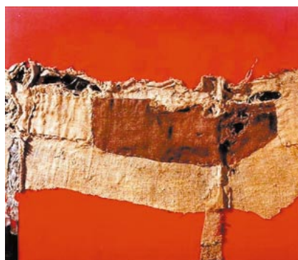
Figura 3. Alberto Burri, Sack and red, 1954, sack and oil on canvas, 86 × 100 cm, London, Tate Gallery [13].