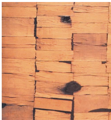
Figura 2. Alberto Burri, Big wood G59, 1959, wood, acrylic and combustion on canvas, 200 × 185 cm, Rome, National Gallery of Modern Art [12].