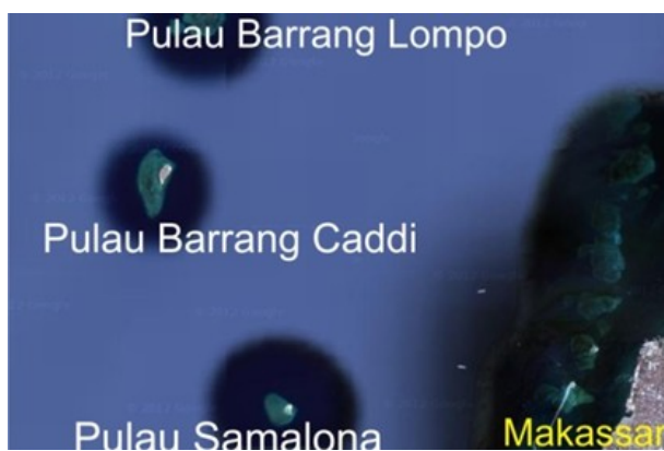
Figure 2. Cu concentration in 3 islands

Analysis of essential metal in sponge by ICP-OES Analysis results of essential metal Cu by ICP-OES can be seen from Figure 2.