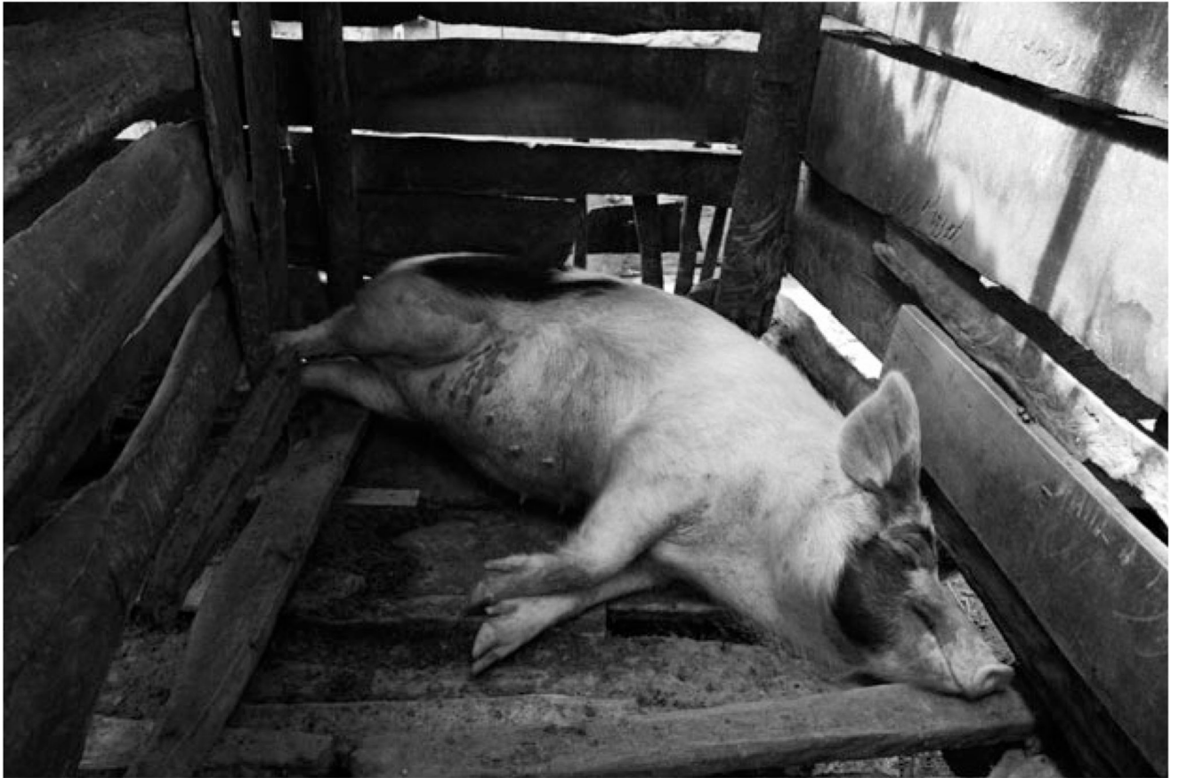
Figure 2. Zero-grazing pig husbandry in Hai.