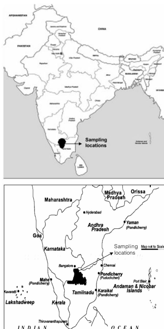
Figure 1. Sampling locations with the background of India and South India respectively.

The individual-site allele frequency estimated at the DRD2 locus by gene counting is represented graphically in Figure 2. All the three marker systems of the DRD2 locus are polymorphic in all the studied tribal populations. The TaqI 'B' allele has a frequency greater than 60% in all the populations and with a maximum of 75%