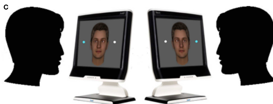
FIGURE 1 | Interactive and dual eye-tracking with virtual anthropomorphic avatars. (A) Interactive eye-tracking setup operationalized for fMRI: a virtual character is shown on screen and can be made “responsive” to the participant’s looking behavior by means of an algorithm-based, real-time analysis of the eye-tracking obtained from the study participant. (B) Schematic setup: two eye-tracking devices are linked via a local area network (LAN), which allows to simultaneously measure two study participants engaged in a

mediated gaze-based interaction (each participant is represented by a virtual character for the respective other). (C) Two participants engaged in a two-person perceptual decision-making task, in which both are asked to discriminate stimuli while the gaze behavior of the respective other participant is visualized on the stimulus screen as well. Importantly, people do not just see where the other is looking via cursor or similar, but actually experience the other’s gaze, to which they can dynamically adapt.