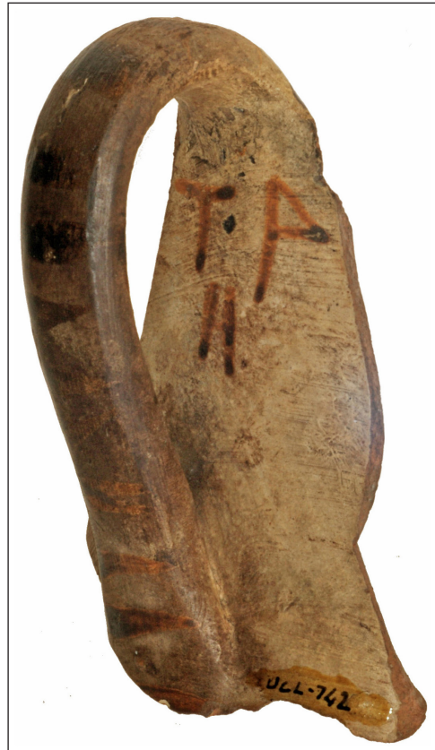
Fig. 4: UCL-742. Chian kantharos. Max. dim. 8 cm.

It was the fifth century historian from Halikarnassos, Herodotus, whose description of Naukratis inspired Petrie's original work. Two sherds bear an owner's graffito by 'Herodotus', but the temptation to equate the name with the historian is to be resisted