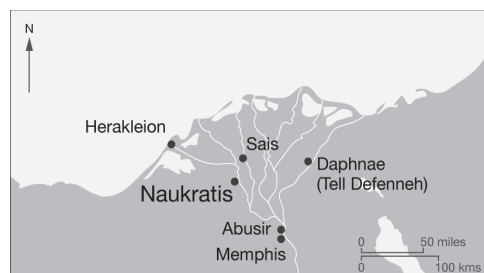
Fig. 1: Map of the Nile Delta, with relevant sites.

The crux of the retrospective part of the project is that the material was widely scattered to museums, roughly seventy. In fact, all my own places of previous employment, Oxford, University College Dublin and UCL possess