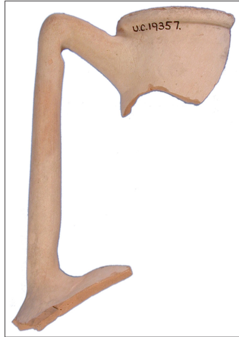
Fig. 3: Petrie Museum 19357. Rhodian amphora handle. Max. dim. 32 cm.

appearance, most notably because they have been trimmed back, as Petrie mentioned in his diary, in order to fit them in the boxes for transit back to London; reassuringly many of these 700 can be equated with Petrie's drawings. In addition, there are about 75 known from the EES distribution lists in other museums, Montreal to Warrington.