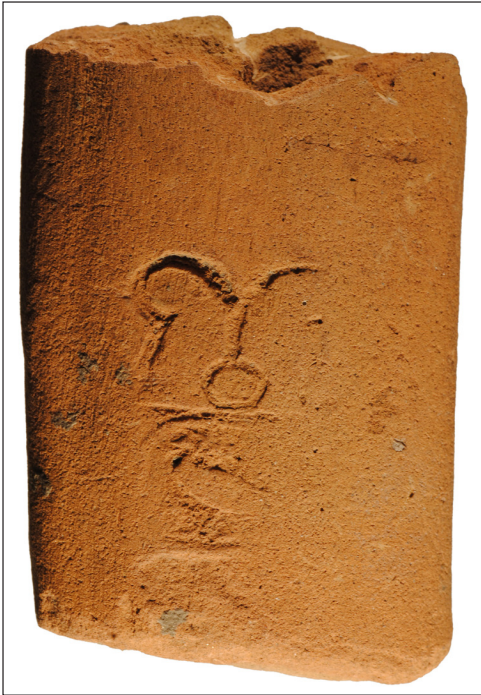
Fig. 2: British Museum GR1888,0601.738. Stamped amphora handle. Max. dim. 8.8 cm.