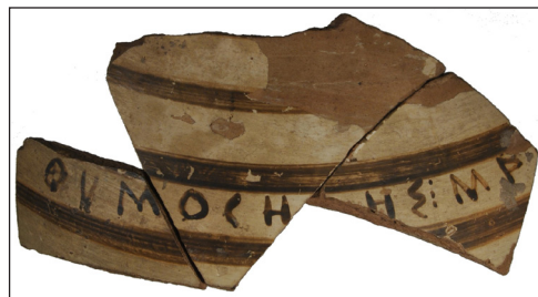
Fig. 5: British Museum GR1888,0601.173 + UCL-736. Chian bowl or lid. Max. dim. 30 cm.

since the typology of the pair lies on either side of his lifetime. Another famous writer with a Naukratite connection is Sappho, the