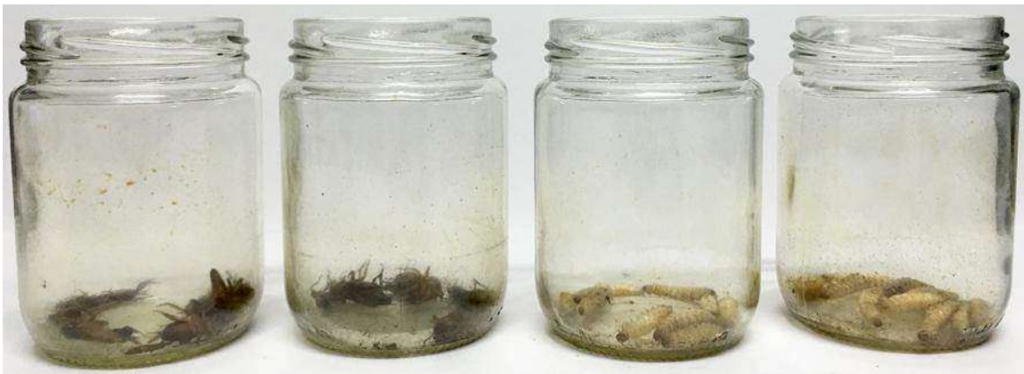
FIGURE 2. Gryllus bimaculatus and Galleria mellonella After Treatment

The average mortality of Gryllus bimaculatus and Galleria mellonella was examined for 24 hours after spraying each extract concentration. As shown graphically in Figure 3a and Figure 3b, the mortality of both insects increased with the increase of extract concentration. The mortality was caused by the poisoning mechanism of tobacco extract through respiratory system, skin contact and digestive tract [27]. Based on the result, higher mortality of Galleria mellonella larvae was obtained at faster rate compared to Gryllus bimaculatus . Such phenomenon might indicate that Galleria mellonella larvae had weaker resistivity towards the toxicity of the extract, so it only required low concentration to cause high mortality. Moreover, the entry of the extract was observed to be more intense because the larvae could not mobilize as fast as Gryllus bimaculatus , so they were unable to escape well. This caused them to consume more of the extract residues within the container. Due to its soft and thin cuticle, the extract became more readily absorbed into their body.