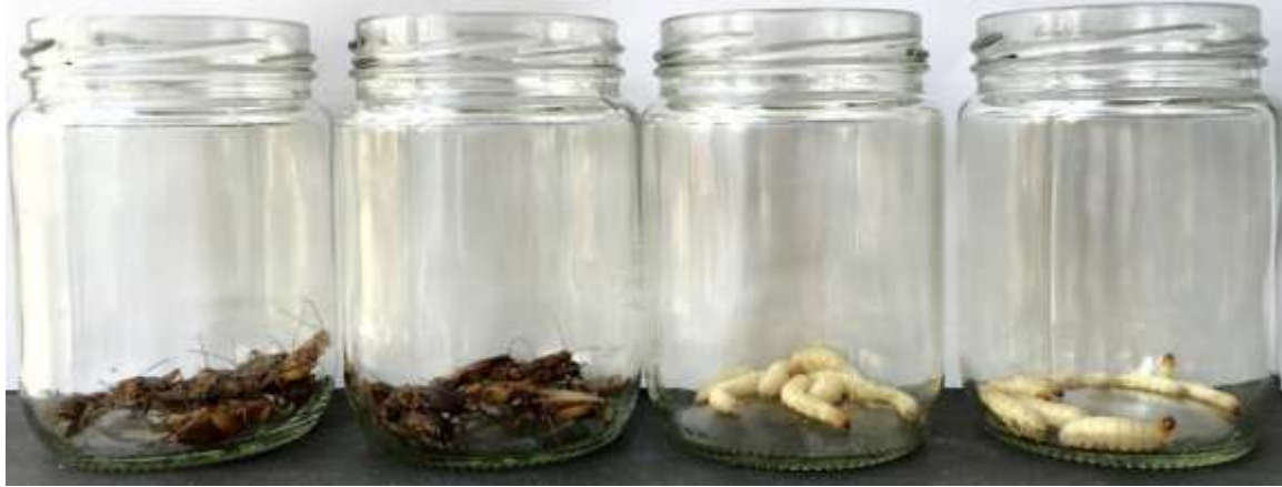
FIGURE 1. Gryllus bimaculatus and Galleria mellonella Before Treatment