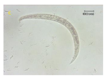
Figure 1. The development of Ascaridia galli eggs. a= First stadium of Ascaridia galli eggs; b= Ascaridia galli infective eggs; c= Ascaridia galli L2.

well-maintained. The use of it influenced the survival of the eggs of the worms. Kim et al. (2012) suggested that the development of Ascaris suum's eggs was highly influenced by temperature. On the contrary, routine change in the temperature was not favorable for the development of eggs that it decreased the viability of the eggs (Mero and Gazal, 2009). Additionally, the use of the aerator also shortened the developing period of the eggs. It was consistent with the opinion of Kim et al. (2012) suggesting that proper temperature would accelerate the development process of A. suum's eggs.