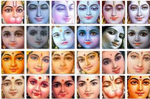
FIGURE 2. Sample images from IDES dataset.

800 deity face images of 20 Indian deities, where each class contains 40 face images. Sample deity face images from IDES are shown in figure 2. It is a collection of illumination and pose varied deity face images. We randomly took 5 different images of each subject as training set images and the remaining images are considered as testing images. The performance of the methods is shown in table 3.