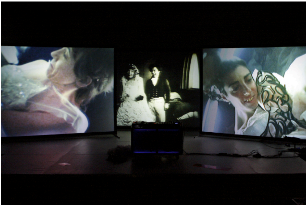
The “wedding scene” near the end.

Near the end, a blue animated figure is dancing on screen while Giovanni echoes the dance on stage, then both female performers climb into the turn table box and disappear. We now see them only on live video camera feed, as they undress/dress into ballet tutus, contemporary female tricksters who seem to play games with the old movie and the Lancelot character (“What a pity you are only a doll,” the intertitles translate him, and then “I can’t believe you are real”). The frame rates, at this point near the end of the performance, seem to have been sped up through reprocessing, and the silent film gains a superb slapstick quality clearly reminiscent of the extraordinary Buster Keaton-like mania of a body getting caught in different rates of speed or the burlesque trompe l’oeil effects of distorted geometries.