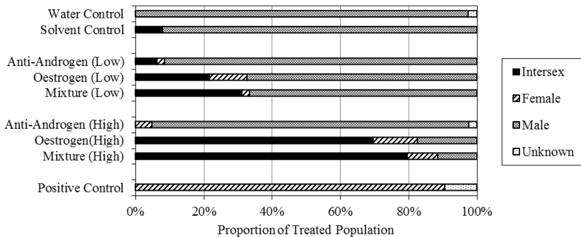
Figure 2. The proportions of intersex, male, female and unknown Japanese medaka within the treated populations based on gonad histology.

Due to the long term nature of this study, some mortality was unavoidable. This occurred in all treatment groups during the experiment. On average, survival was over 80%. However, lower survival was observed in one water control tank (56%) and a solvent control tank (72%). Survival was also lower in the two positive control tanks (60% and 68%), which were sampled early after 91 days as a result. The exact cause for mortality was unknown, although in the control tank temperature fluctuations could be implicated. Indeed, this tank experienced a greater temperature range (5.7°C) than the other tanks in this experiment. In the case of the positive controls, previous studies have observed mortality in fish associated with very high