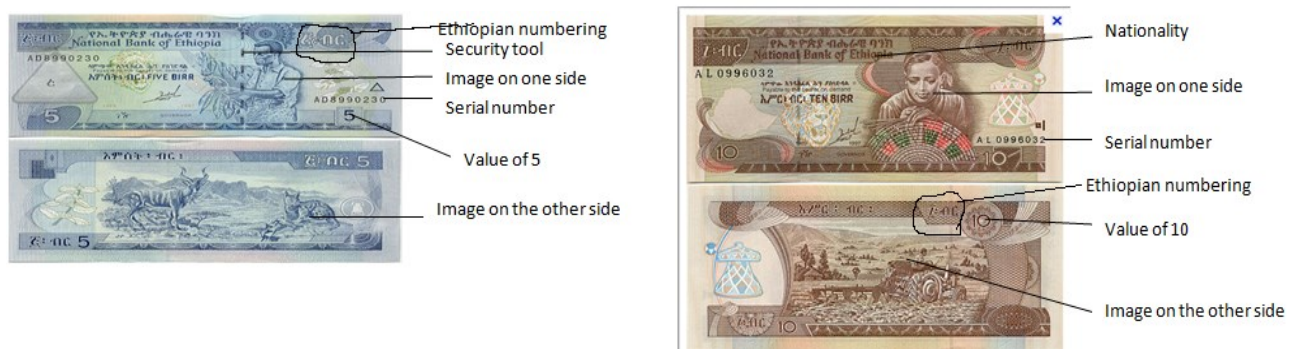
Figure 1: characteristic feature of Ethiopian money bills of five and ten birr