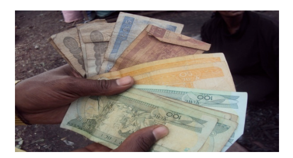
Fig. 2. Color based identification and sorting of money

In order to propose our mobile money system design for rural illiterate Ethiopians, it is important to look into the everyday practices of such communities. From the field work data of 2012, we found interesting practices that inform new system design and worth explanation: (1) practice of money counting while making payments and or receiving payments, to know balances at hand, (2) making money changes during transactions, (3) sorting and arranging money notes based on denomination, (4) making simple mathematical computation (addition, subtraction, division, and multiplication. Any new system to be designed for illiterates need to facilitate the execution of these practices in digital money form too. It is our belief that this paper has contributed towards many of these issues.