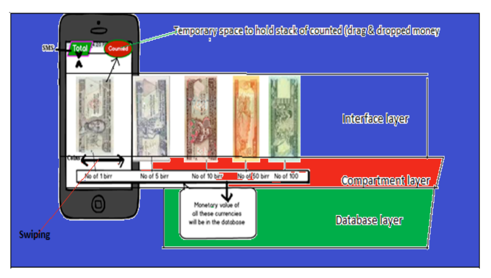
Fig. 4. Design of mobile money information system

placeholder, swiping, frequency counter, total controller, audio assist, and temporary holding place. The design of the system has three layers as indicated in Fig. 4 below.