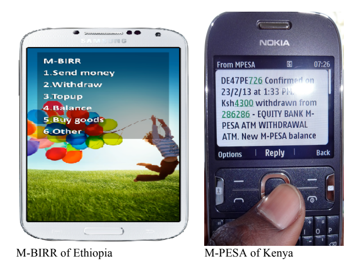
Fig. 1. Interface of M-BIRR and M-PESA