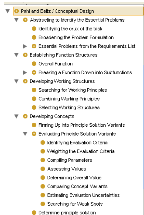
Figure 3: Class and class hierarchy of design decisions in conceptual design.

With reference to the analysis of different quality problems in quality management domain, the problems can be analyzed from four viewpoints such as man, machine, material, method,