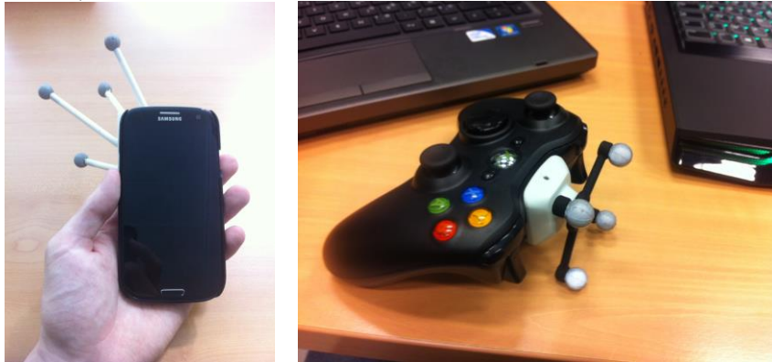
Figure 2 : The peripheral used for the experiment with a body of tracking: a Samsung Galaxy SIII (left) and an XBOX 360 gamepad (right)

A simple scene was constructed for the purpose of the experiment. It consisted of a fictive Renault's automobile assembly plant (30 m × 20m) with realistic distances, sizes. The different routes to follow covered the entire scene.