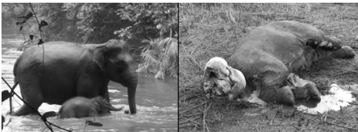
Fig. 2. Sumatran elephants in Bukit Tigapuluh: a cow with calf following her herd into the dense jungle after taking a bath and feeding on water plants (left), and the already decaying remains of a subadult bull that was shot by poachers in order to cut off his small tusks (right).