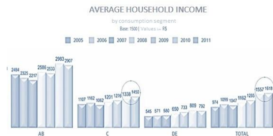
GRAPH 2 – Average household income for each consumption segment

In addition to this significant increase in the number of people belonging to the base of the pyramid, their income has also seen significant growth, being around 8% over the previous year (Class C), as shown in Graph 2. Still analyzing this graph, it can be noticed that the increase in total average household income in the country was mainly driven by the class C income growth.