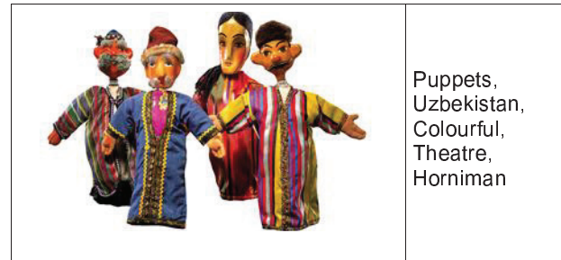
Figure 8: Image and associative tags

Of the adult only sessions, 70% featured laughter and playful comments, these included reactions to another participant deleting a newly created tag, or commenting on the content of a tag. Consequently for the adults, the creation of a tag, or modifying a group member's tag was often perceived as a playful action. 60% of the adult's sessions also featured an attempt by at least one of the participants to synchronise their actions with the group (i.e. not clicking Next until others were ready to move to the next image / vote).