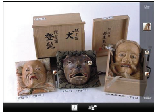
Figure 1: Selection Scene

2. Forum scene: if an image is judged to be interesting enough by the agents, the users are taken to the forum scene where they can engage in a full discussion of the image. Users can add, delete, weight tags, and can see the actions of the other users so they have a sense of what the group are interested in. They can also view images that were previously added to the collection. The Forum scene is shown in Fig. 2.