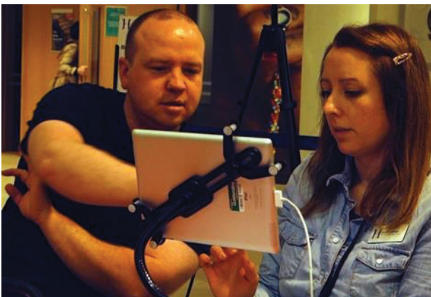
Figure 7: Adult only group

The children's tags varied. If supported, simple words were elicited and verbally spelt by the parent (i.e. a visible colour). If the children were unassisted, there were some attempts at adding tags (if they had adequate literacy skills), but quickly this would often shift to random typing.