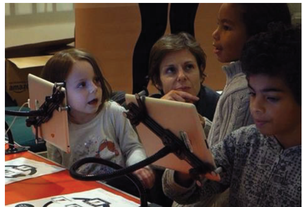
Figure 5: Children using WeCurate with parent

The use of WeCurate in the museum was largely dominated by children. In these sessions, the parent and child would share a single device, which allowed the parent to manage the child's interaction and completion of the task. In their interactions with the system and the task, 89% of these actions were initiated – the sequence of a discussion or course of action – by the adult.