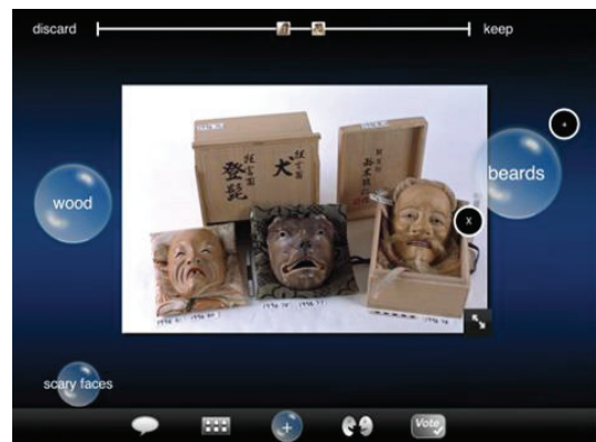
Figure 2: Forum Scene

3. Vote scene: the decision is made to add an image to the group collection, or not, by voting. The voting scene is shown in Fig. 3.