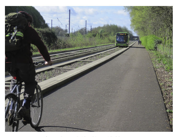
Fig. 1. The Cambridgeshire guided busway

Walking and cycling had been possible on the path before its official opening. If participants had indicated using the path in wave two (2010) or three (2011) of the survey but not in wave four (2012) (walking, n=35; cycling, n=12), we carried forward these positive responses to wave four. Sensitivity analysis showed that restoring these imputed positive responses to their original values made no substantial difference to the results.