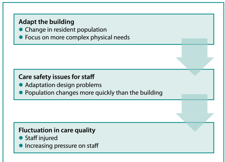
Figure 3. Changing residents' needs and infrastructure problems at Iris House

Ethical approval: The project was funded by the PANICOA programme of the Department of Health and Comic Relief.