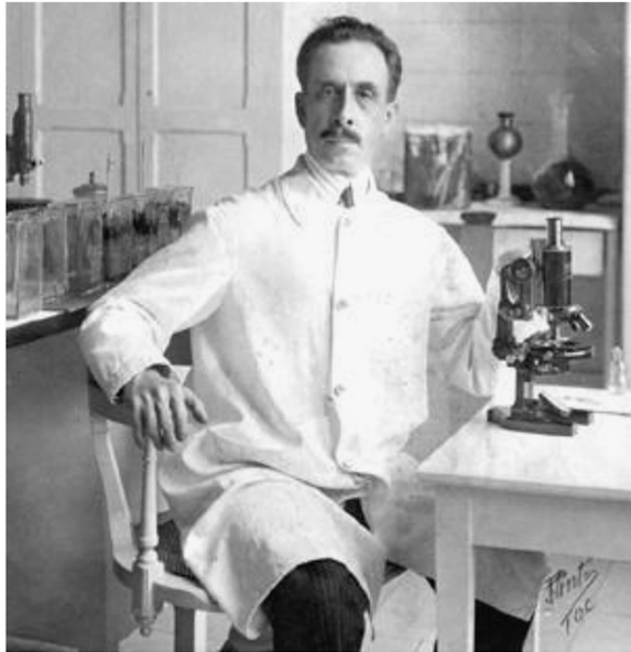
Figure 1 Carlos Ribeiro Justiniano das Chagas in his laboratory at the Federal Serotherapy Institute in Manguinhos, Rio de Janeiro. The Brazilian hygienist, scientist and bacteriologist identified the protozoan parasite T. cruzi as the causative agent of Chagas disease.