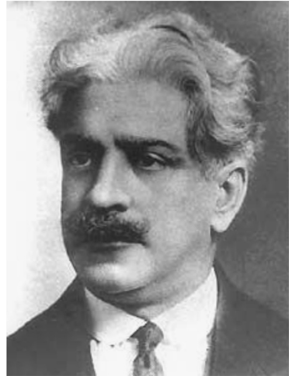
Figure 2 Oswaldo Gonçalves Cruz. The Brazilian physician, bacteriologist and epidemiologist was the mentor of Carlos Chagas who discovered American trypanosomiasis. Cruz founded in 1900 the Federal Serotherapy Institute which was renamed in 1905 to Manguinhos Experimental Pathology Institute, then in 1908 to Oswaldo Cruz Institute and finally in 1974 to Oswaldo Cruz Foundation (Fundação Oswaldo Cruz (Fiocruz)).

Without doubt, the discovery of American trypanosomiasis is inseparably linked to Carlos Chagas. However, other researchers have also contributed to the findings. Oswaldo Cruz's mentoring and the institute he and the Brazilian government founded in 1900 to fight endemic diseases played an important role in the uncovering of Chagas disease [49]. The identification and characterisation of T. cruzi was the result of collaboration with the Czech zoologist and parasitologist Stanislaus von Prowazek (1875-1915) who was invited by Cruz to spend six months at the Federal Serotherapy Institute to conduct research (reviewed in [50]). The intracellular life cycle stage of T. cruzi , the amastigote form, was described by Chagas' colleague, the Brazilian pathologist Gaspar de Oliveira Vianna (1885-1914), in both heart and skeletal muscle cells [51]. The mode of transmission of T. cruzi was established by the French parasitologist Alexandre Joseph Émile Brumpt (1877-1951) who provided in 1912 clear evidence that the infection resulted not by inoculation but by contamination of the bite wound with parasite containing faeces left behind by the bugs [52].