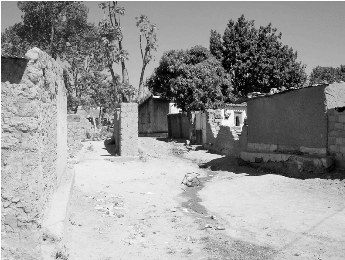
Figure 4. Scope for densification in informal peri-urban area, Huambo