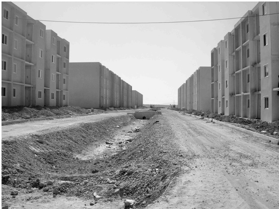
Figure 2. ‘New centrality’ under construction in 2013 near Huambo

At the city-region level, a circular rural/urban migration exists, linked to daily and seasonal movements connected to work and use of services, with population in the rural areas surrounding Huambo on the whole remaining relatively stable. Though there is some rural-urban migration from the region and beyond, the bulk of population growth, which is quite rapid, is based on natural growth. Overall city size is probably in the region of 1 million, though estimates vary greatly as discussed earlier. In terms of physical growth there is an axis of emerging development between Huambo and the town of Kaala, 20 kilometres to the West. Most of the area officially designated as ‘urban’ (‘foral’, as classified during the Portuguese colonial period), is occupied by unplanned peri-urban areas, though there are also around 15 planned layouts for urban expansion which are not yet fully occupied. In addition the national government has promoted the construction of ‘new centralities’, as part of a national housing programme – mostly turn-key housing projects which are distant from the city and not yet inhabited (Figure 2).