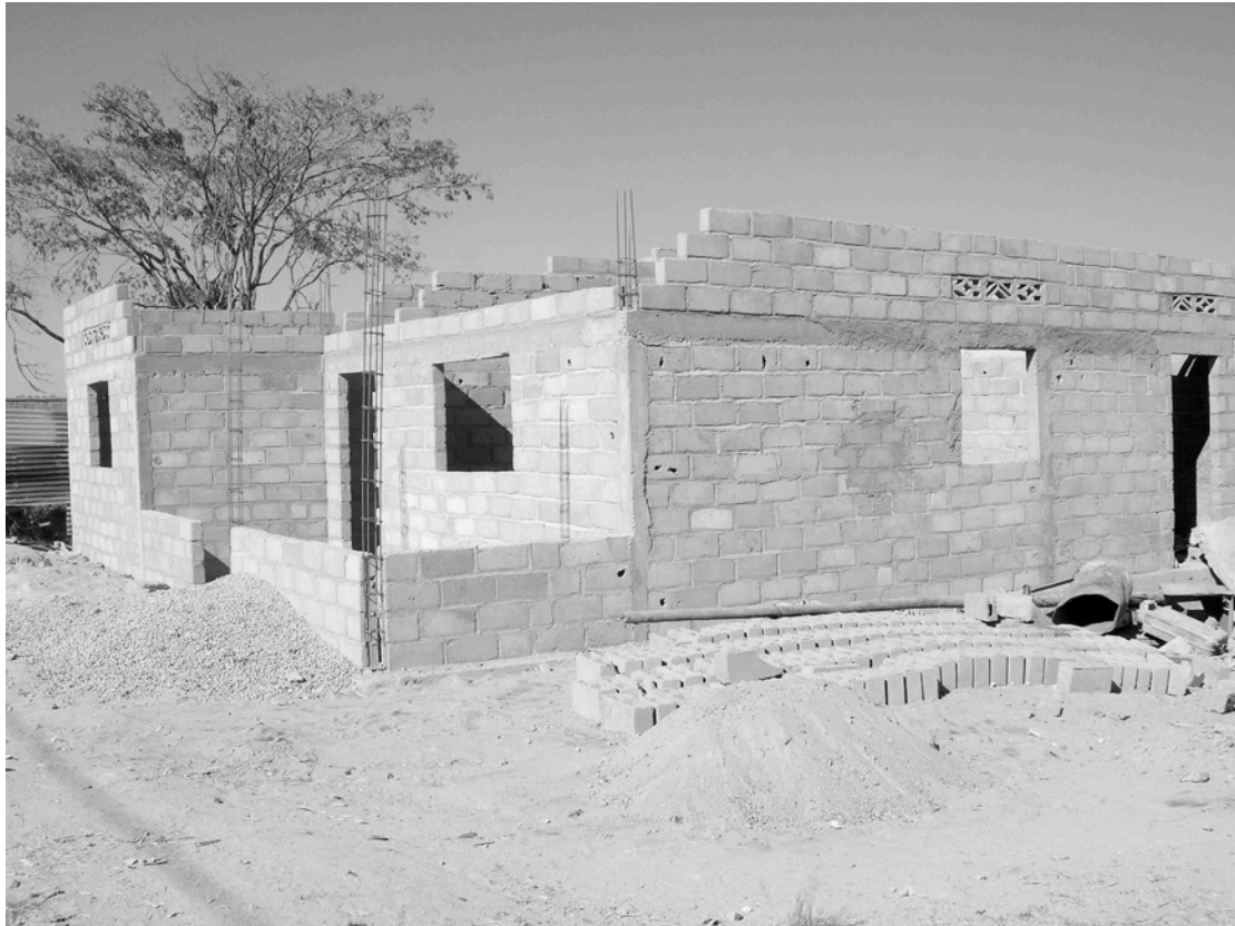
Figure 6. ‘Modern’ house typology under construction in Huambo