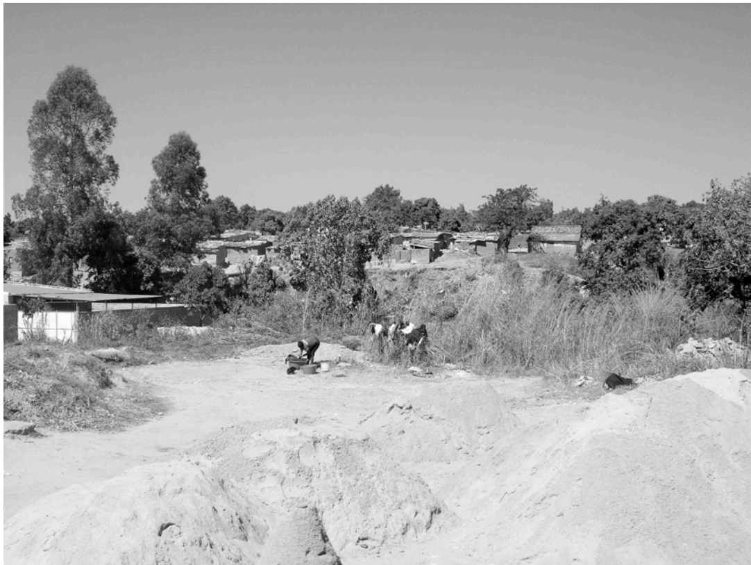
Figure 5. Informal settlement in vulnerable valley location, Huambo