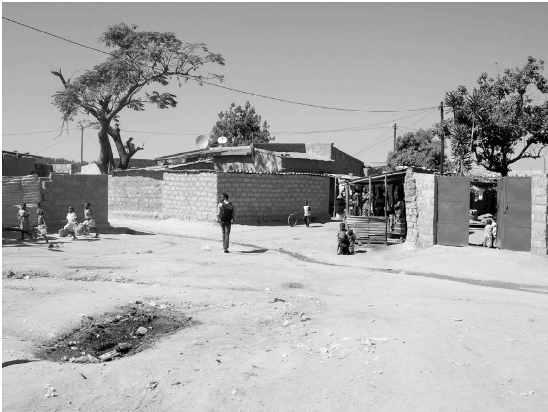
Figure 3. Typical older consolidated informal peri-urban area in Huambo

are occurring at a relatively fast pace: increasing building on open spaces within plots; and occupation of open space within less consolidated areas (Figure 4). Physical expansion is taking place mainly along transport corridors where there are good connections and/or access to infrastructure, as well as around certain nodes such as markets and educational facilities. Infrastructure (especially water and sanitation) is very weak, with piped water supply existing mostly in the 'formal' city, while the rest is supplied by boreholes and wells, and sanitation in peri-urban areas being dealt with through latrines and some on-plot septic tanks, with the concomitant risk of water supply contamination. Formal electrical supply through pre-paid meters is spreading, though many illegal connections to the power supply still exist. Consolidated access roads are scarce, and storm water drainage is practically inexistent in peri-urban areas. There is increasing environmental risk of erosion, though not of flooding given that city development has followed ridges rather than valleys. However, 'informal' areas are spreading into the bottom of valleys and gullies, occupying hazardous areas (Figure 5).