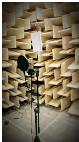
Figure 3 – The setup for voice recording in the anechoic chamber

It is foreseen that the room acoustic phase of the study, including the data analysis, should be completed by the date of the Inter-noise 2013 conference. The results of the first phase of the study will therefore be presented at the conference.