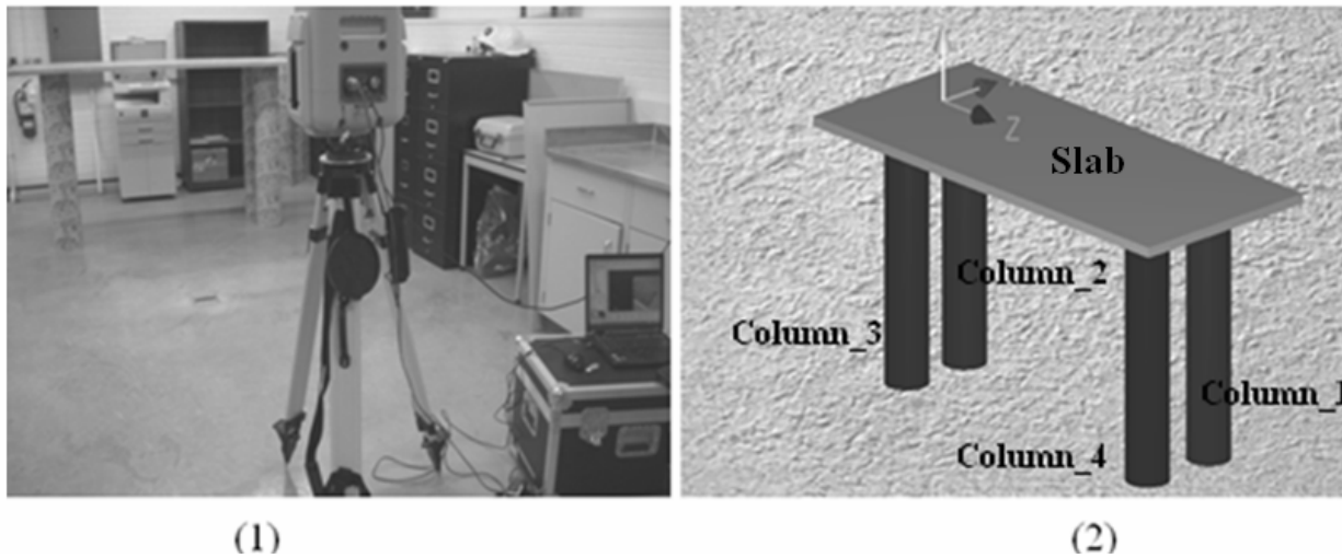
Figure 2: (1) The scanned scene with the structure and the laser scanner, and (2) a rendering of the 3D CAD model of the structure