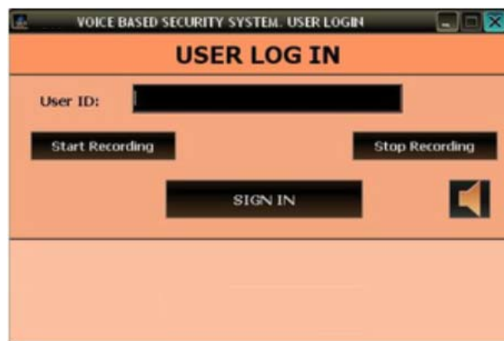
Figure 3. Login screen

Figure 3 and Figure 4 show the capture of the login screen and login change password screen of the research.