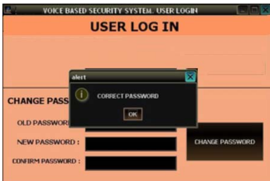
Figure 4. Login change password screen