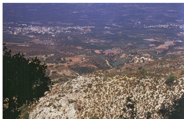
Figure 2. The plain of Elos in Laconia, Greece. Wetlands and marshes are clearly visible (photo courtesy of Antonis A. Kousoulis; May 15, 2011).

Hippocrates frequently referred to a burning disease. This is the fever he mentioned more than any other in his writings, thus we can reasonably assume that the disease was unusually prevalent during his times. 9 He also recorded a feverish disease epidemic attributed to factors emanating from marshes. 10 It has been suggested that these infections (which occurred acutely, had remissions, and were occasionally fatal) 11 are to be identified with remittent or sub-continuous malarial fever. 10,12,13 The confusing part of this assumption is that while malaria in the Mediterranean is a summer disease, Hippocrates clearly asserted that this fever occasionally occurred in the autumn and winter. 10,11 The true explanation for this lies most probably in the fact that the malaria season (when malaria was endemic) differed across Greece; it has been recorded that in the area of Sparta, epidemics occurred from mid-September to November. 14